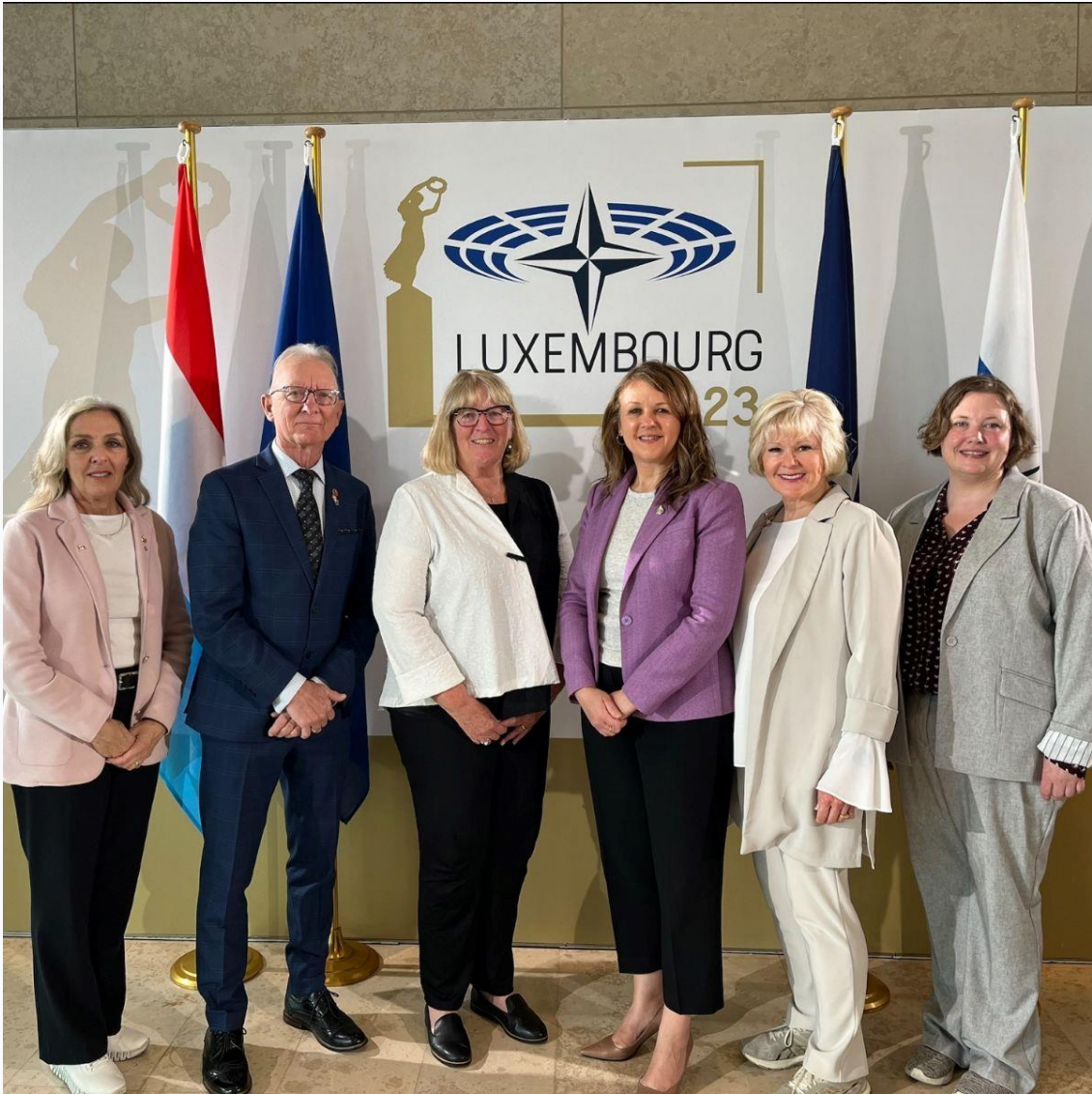
Senator Rebecca Patterson, Senator Pierre-Hugues Boisvenu, Senator Gwen Boniface, Julie Dzerowicz, MP Cheryl Gallant, and MP Rachel Blaney at the Spring Meeting in Luxembourg