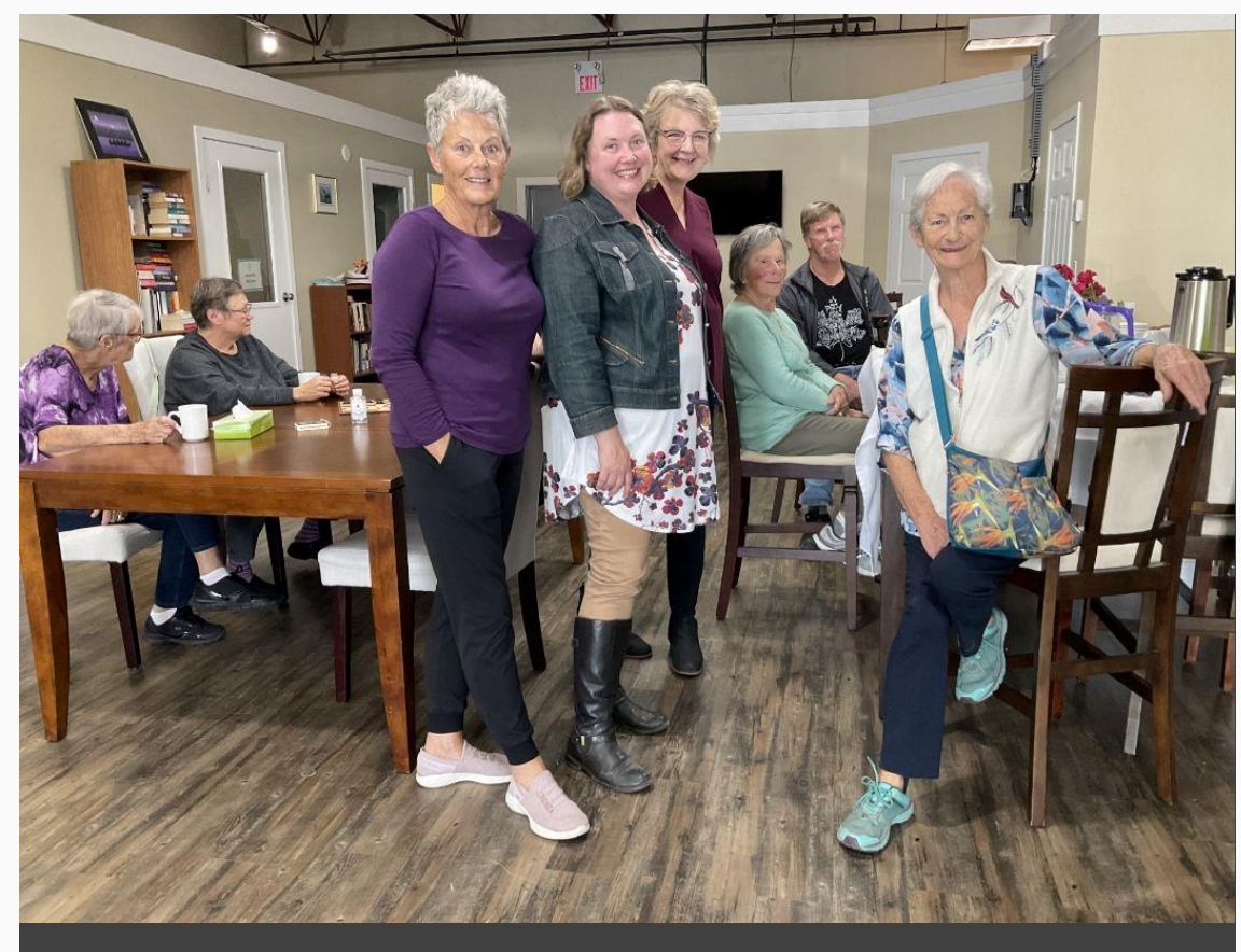
Chatting with Seniors at Gerry Gray Place in Powell River

poverty line. The NDP and I will continue fighting for Canadians under the age of 75 to receive the financial support they need to help them meet the high costs of living.