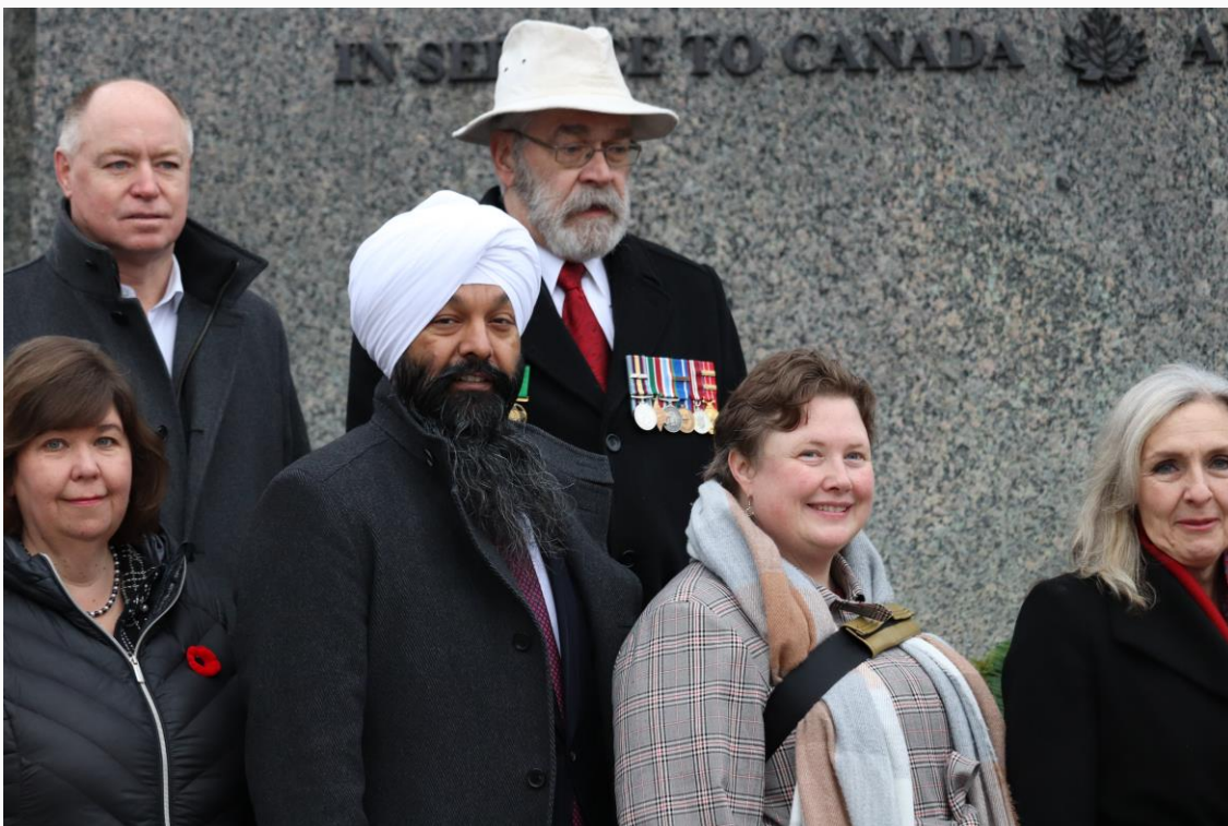
At the Persian Gulf War Ceremony

We will always be there to help support our veterans and their families in their time of need."