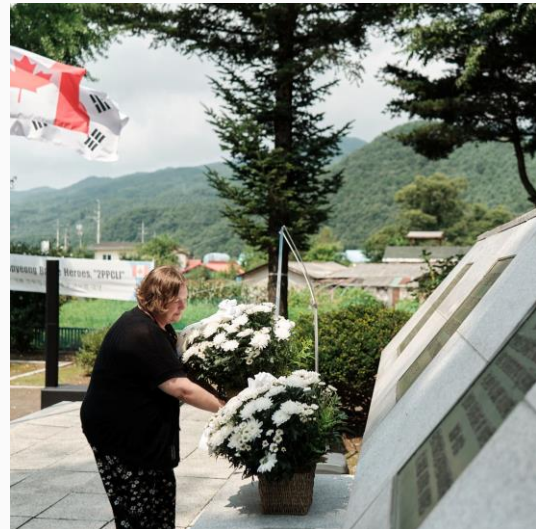
Photos from trip to South Korea. I was privileged and grateful to be among the Canadian guests invited to the 70th Anniversary of the Korean War Armistice in Korea in July, 2023.