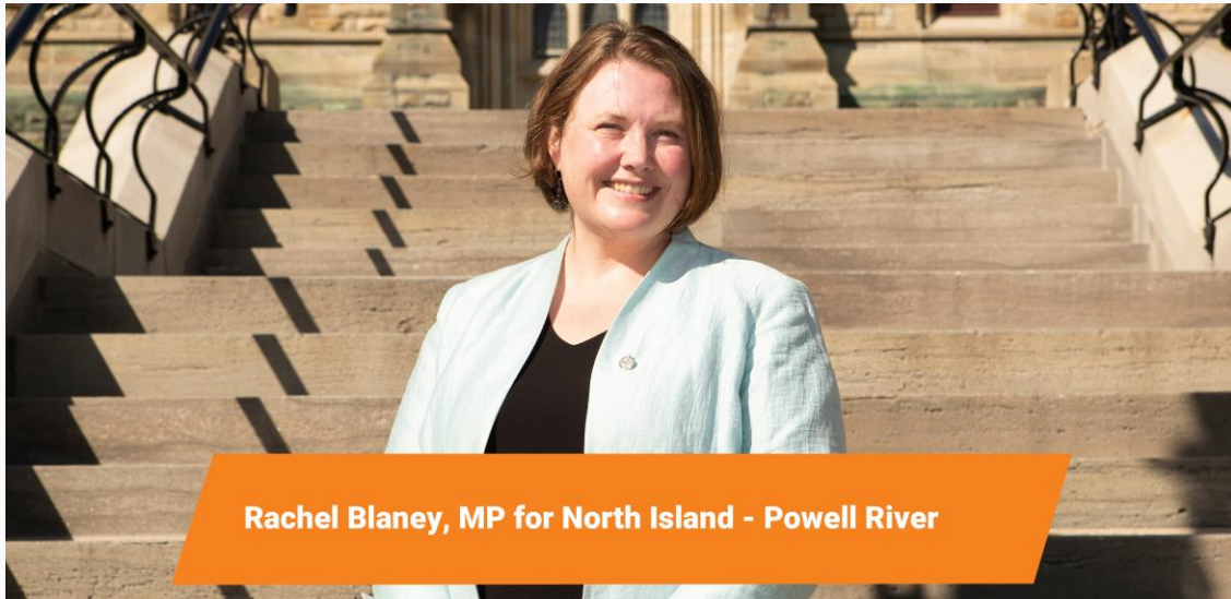
Rachel Blaney, MP for North Island - Powell River